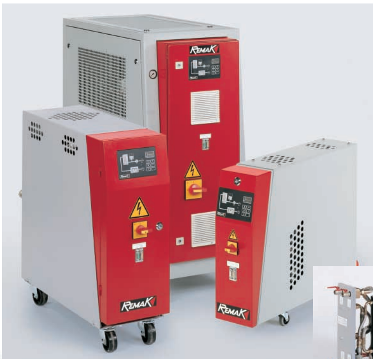
temperature control units