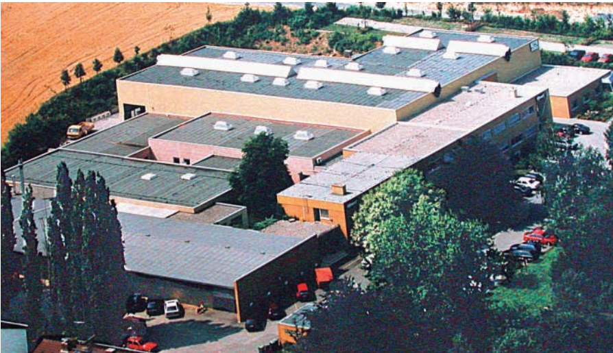
Aerial view of the company

Since 1987, the company has been part of the international acting Klöckner Werke AG, Duisburg.