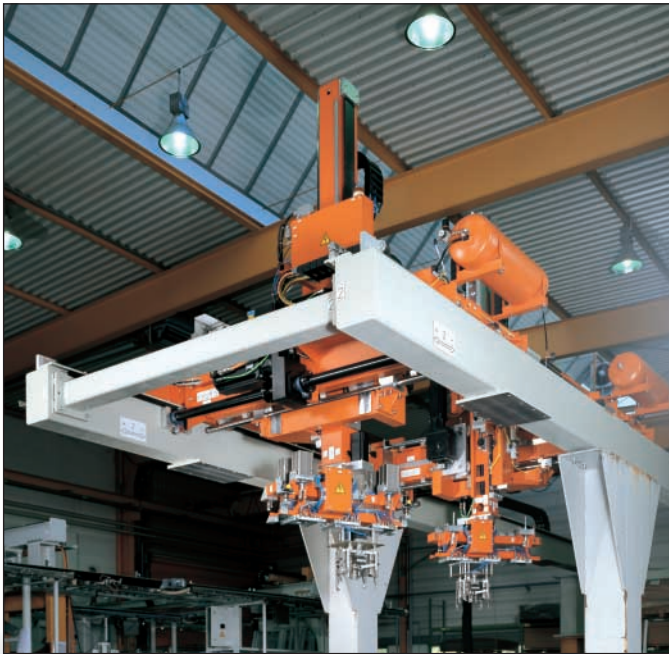
free standing gantry robot

And if you want to be completely sure, we can offer you a maintenance agreement - our technicians will carry out a regular “check-up” of your machinery, and if necessary suggest the relevant preventive maintenance.