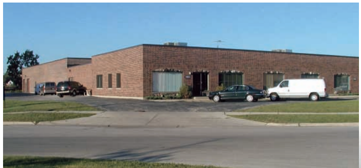
REMAK of North America, Inc.